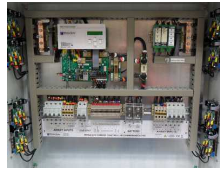
600A Solid-State Charge Controller