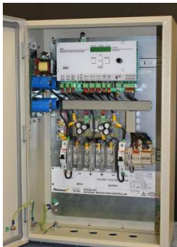
25A Cathodic Protection Controller

The company remains committed to serving old and new customers alike, both supporting existing equipment in the field as well as developing new products and technologies to remain at the front of the industry. We are fully accredited to ISO 9001:2008 and endeavour to provide and maintain the highest level of service